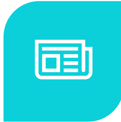
BUSINESS CONTINUITY STRATEGY UPDATE